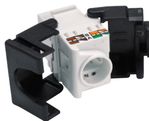
C. Rear view of Keystone with wire cap attached